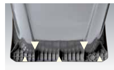
Reinforced lifting comb