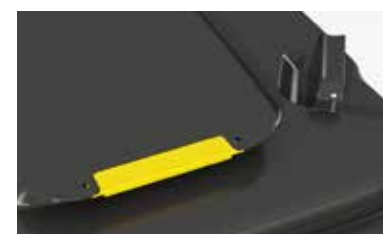
Lid type Ergolid with clip