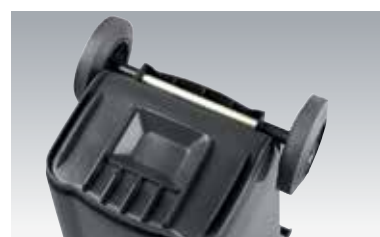
GMT eXtra 120 S und 240 S with reinforced base