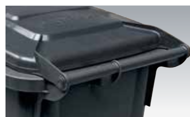
Lid with 2 point hinges