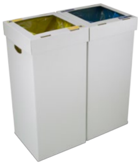
Recycling Station 2 x 100 l.