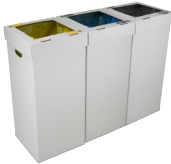
Recycling Station 3 x 100 l.