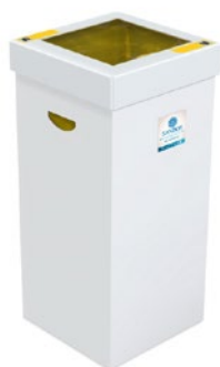
Aneto Personalization with Adhesive